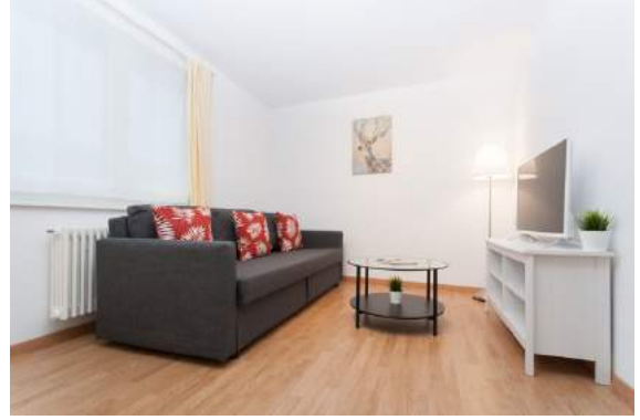
2.5 (One-bedroom apartment)