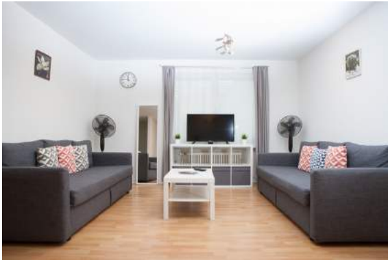
3.5 (Two-bedroom apartment)