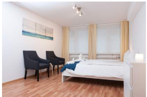
4.5 (Three-bedroom apartment)