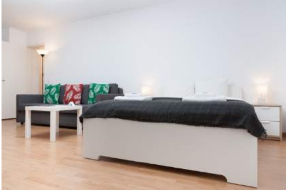
1.5 Room (Studio)